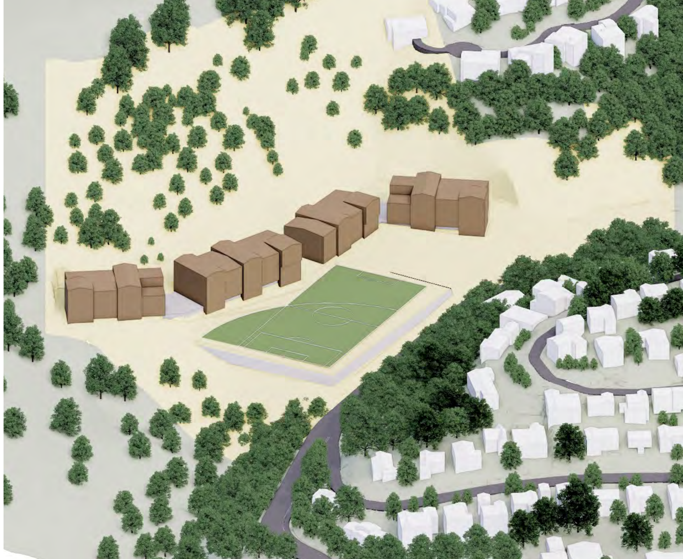
VIEW EAST ALONG MORAGA AVE