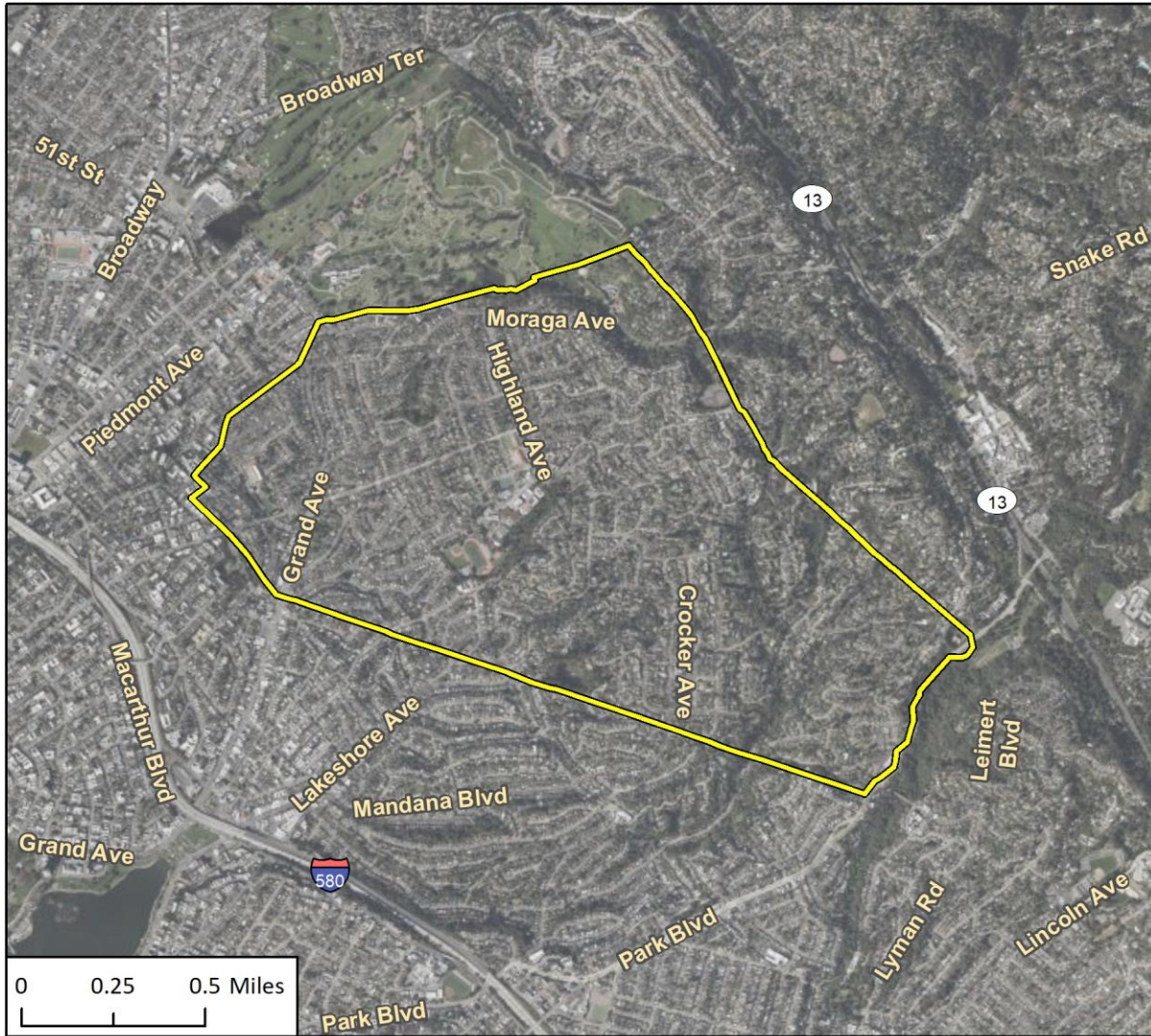
Figure 1 City of Piedmont Location Map